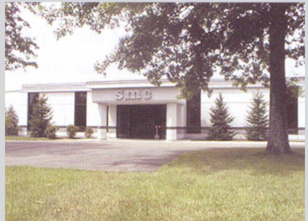
MVS Saegertown Manufacturing.