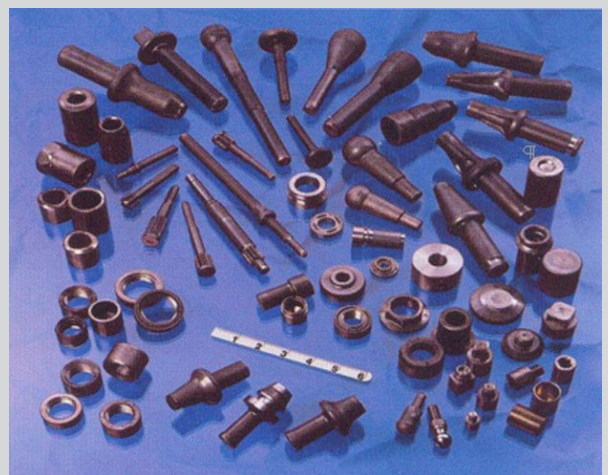
Some of the products manufactured at Saegertown.